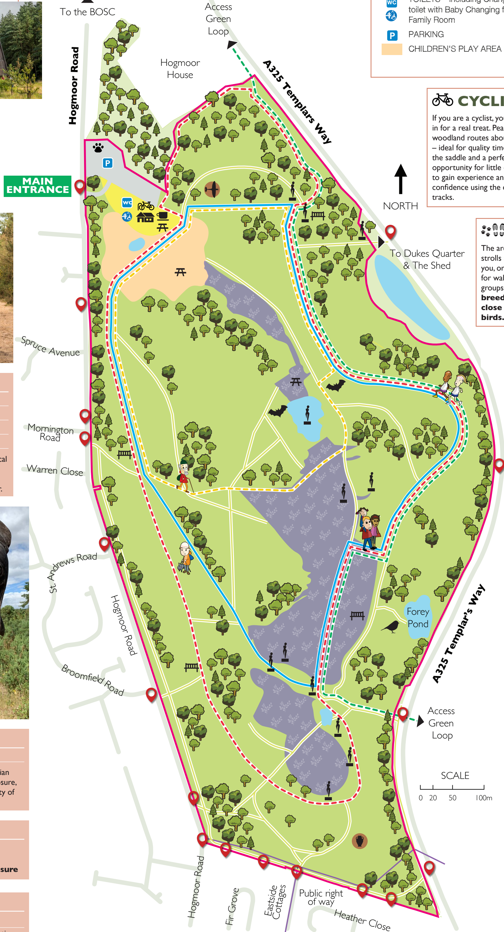
Central pond within Hogmoor Inclosure