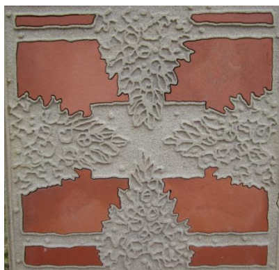
4. Pyramidal Orchid