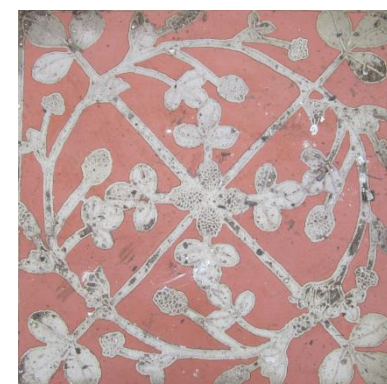
7. Small Cranesbill