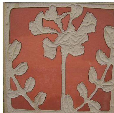
3. Horse Shoe Vetch