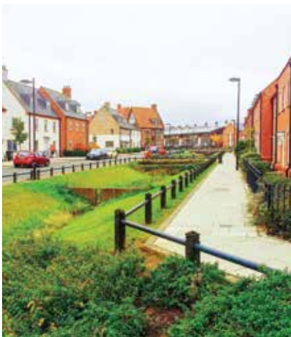
Langdon Lake and Meadow

Once blighted by anti-social behaviour and now a 16 hectare nature reserve and popular countryside retreat within a mainly urban area.