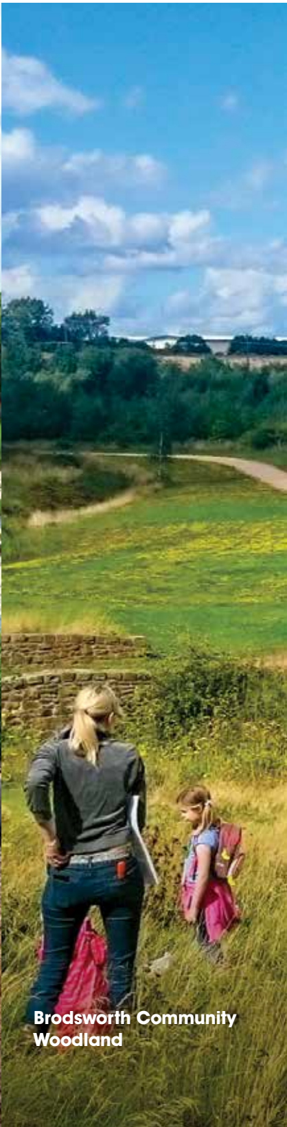
Brodsworth Community Woodland