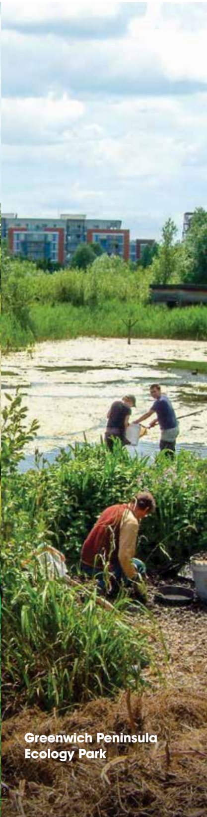
Greenwich Peninsula Ecology Park