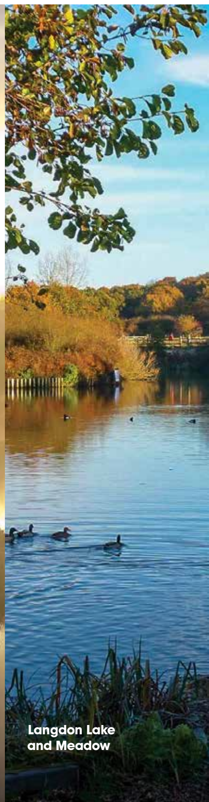
Langdon Lake and Meadow